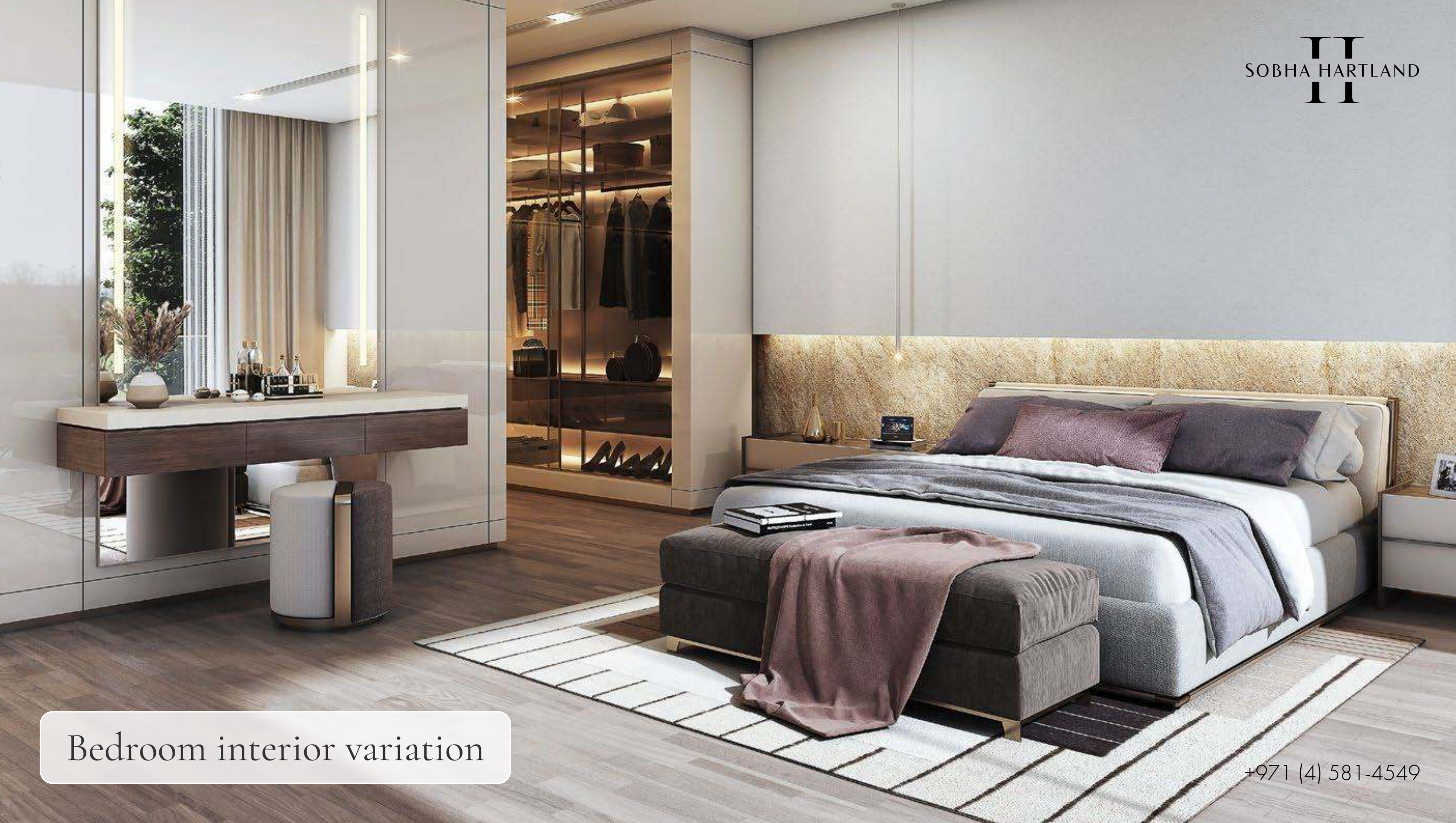
Bedroom interior variation